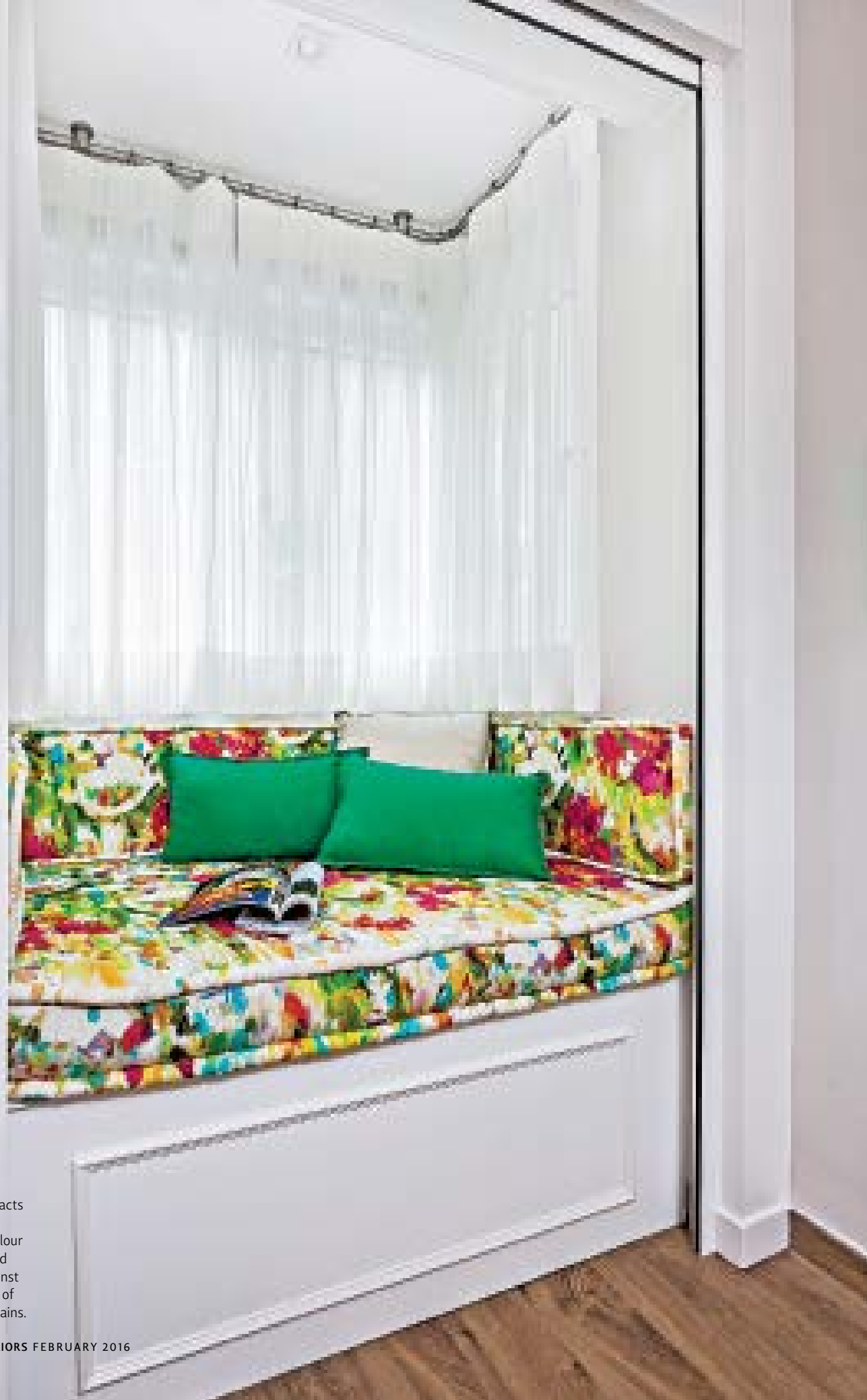
The bow window acts like a little private sanctuary. The colour of the bedding and cushion pops against the pristine white of the walls and curtains.