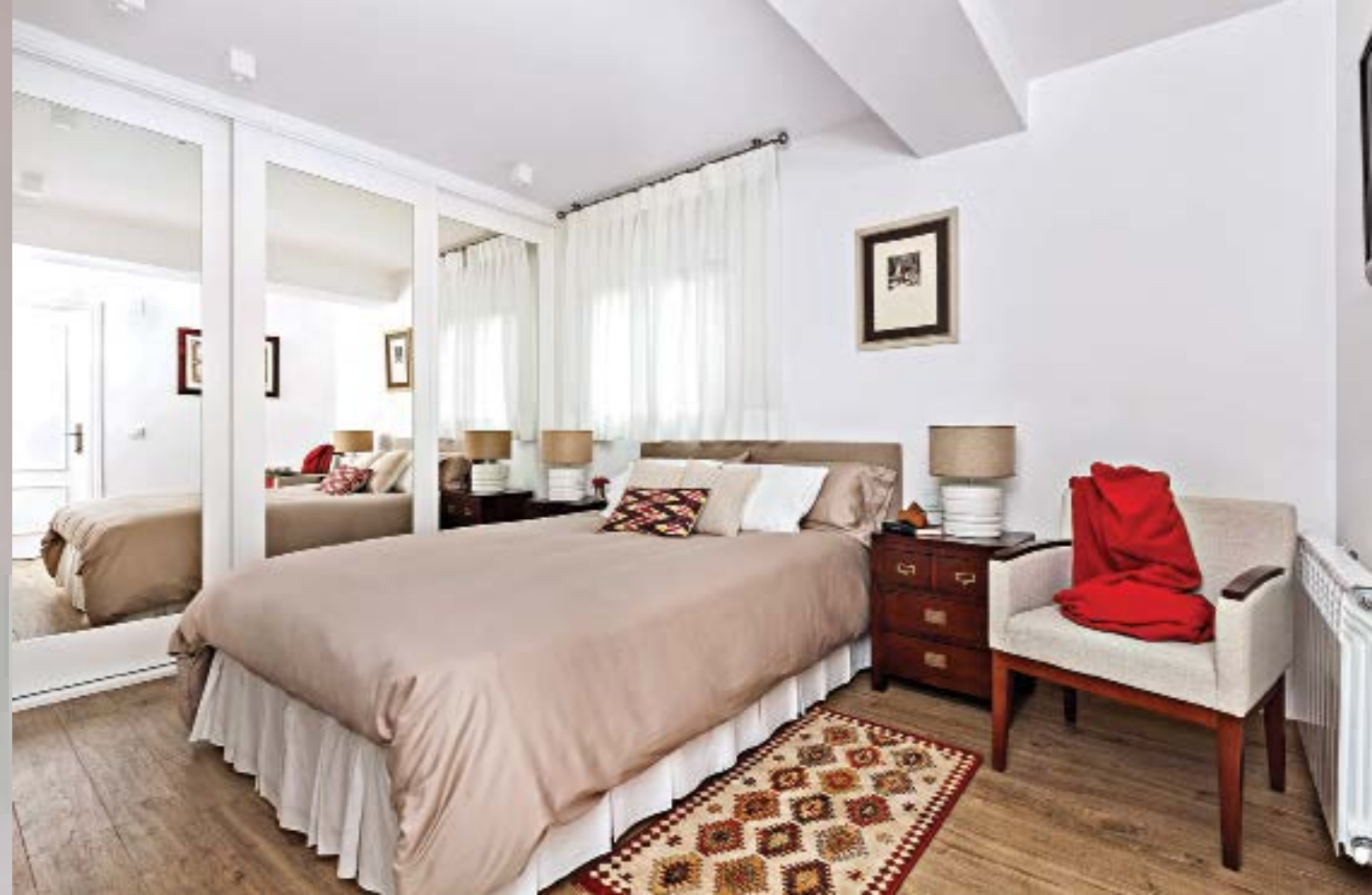
ABOVE The beige bed linen, ikat cushion, kilim and chair help create a cosy and comforting ambience in the master bedroom.